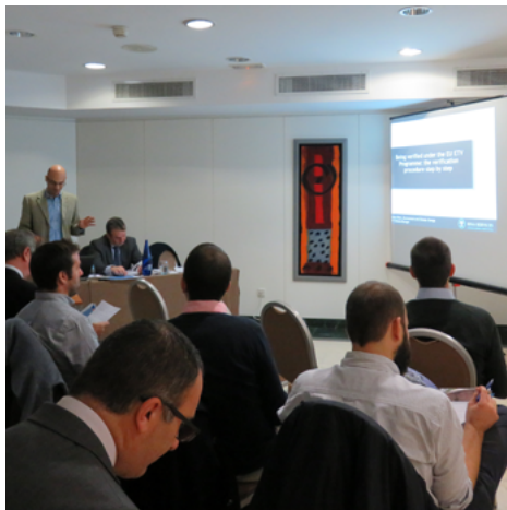
ETV Technical Training, Madrid, 18 November 2016