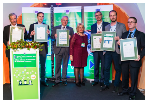
Official delivery of Statements of Verification Ceremony, Tallinn, 26 October 2016

On 26 October, during the 20th European Forum on Eco-innovation in Tallinn, Estonia, an official ceremony was organised for the delivery of new ETV Statements of Verification. Verification Statements are the end product of an ETV process and ascertain the performance of the innovative technology. Six technology developers were handed their Statements of Verification during this ceremony, out of the twelve companies who achieved a technology verification under ETV since the last ceremony in 2015: Adept Water Technologies , AGRO-EKO Ltd. , Base sarl , FuturaMat , Greengage Lighting Ltd , G3 Enterprises , Ingegnerie Toscane srl , Komtec Miljo af 2012 A/S , NOVAMONT Spa , Pozzoli Depurazione srl , PurFil Aps , and SELMA sp. z o.o. sp.k.