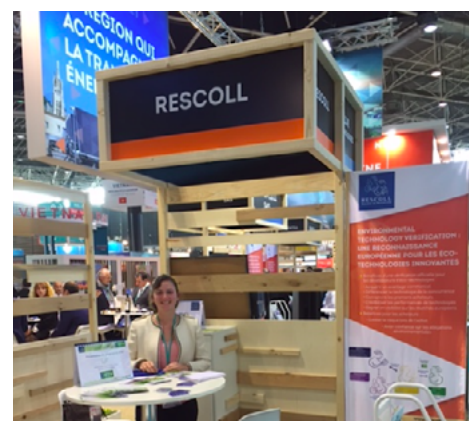
RESCOLL stand at Pollutec

European Commission representative and the French Verification Body RESCOLL attended the 27th edition of the leading general trade show on the environment, Pollutec , in Lyon, France. The ETV pilot scheme was introduced to a large number of business representatives, in particular during the Green Days matchmaking event as well as via presentations at the Infoday H2020 event and at the Sustainable Industry Forum.